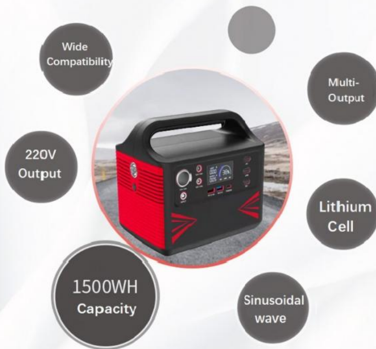
Products HD Pictures: